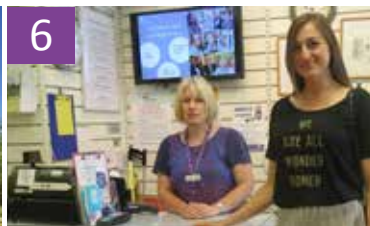
Charity shopper extraordinaire