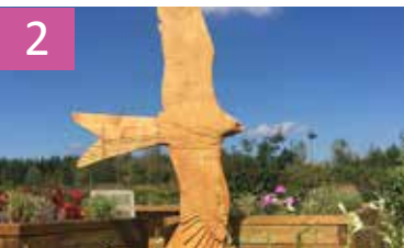
New garden sculpture