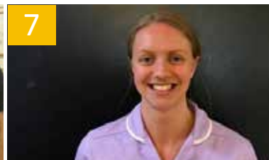
Finding a vocation